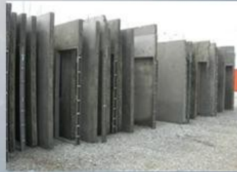
160mm x 5.8m 150mm/160mm